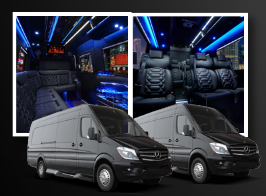
SPRINTER LIMO & SHUTTLE SEATS UP TO 14