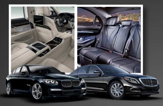
LUXURY SEDANS BMW 740Li | MERCEDES S550 SEATS UP TO 1-3