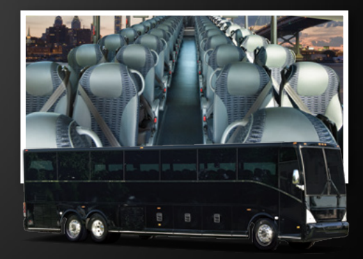
MOTOR COACHES SEATS UP TO 56