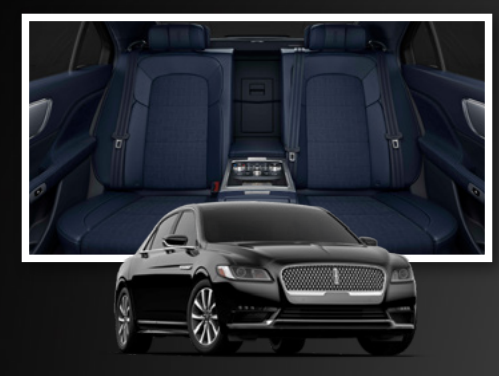
SEDANS LINCOLN CONTINENTAL SEATS UP TO 1-3

features. Our entire fleet takes part in a comprehensive preventative maintenance program, ensuring that you will always be traveling in a clean, safe and reliable vehicle on every trip you take.