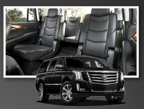
EXECUTIVE SUV SEATS UP TO 1-6