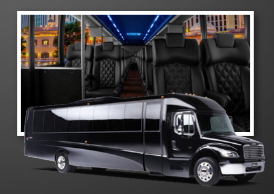
LUXURY COACH SEATS UP TO 40