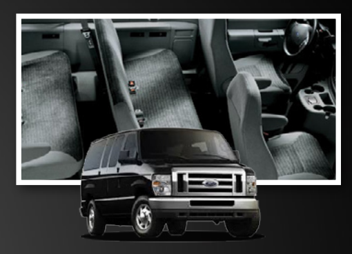
PASSENGER VAN SEATS UP TO 10-14