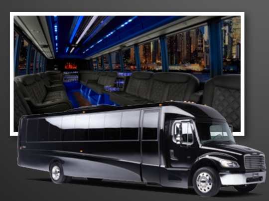
LIMO BUS SEATS UP TO 26